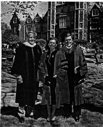
The Spiro-Smith partnership is launched in 1989